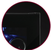
FULL GLASS DOOR