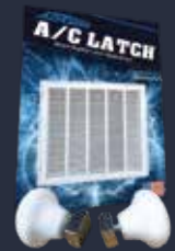
A/C Latch Grill Latch Replacement