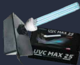
UVC Max 25 Whole House Purifier

CHECK OUT THESE PRODUCTS AT FINE RETAILERS NEAR YOU