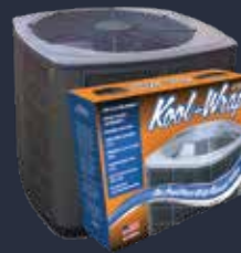
Kool-Wrap Condenser Filter