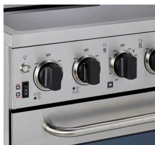
Modern knobs designed for easy use