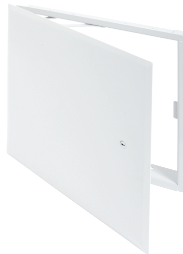
Rough wall opening is door size + 1/4" or + 6mm