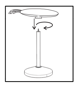
Step 3 Now keep (A) over upper of threaded stud (D) then do full tight (A) clockwise