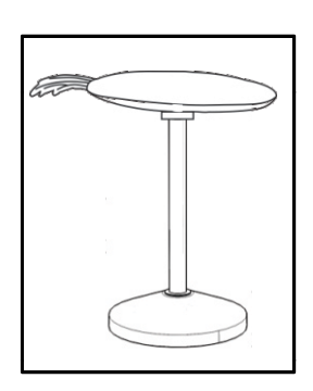
Step 4 Final Product