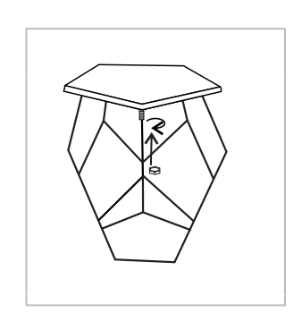
Step 2 Screw Base legs (B) to top (A) tray