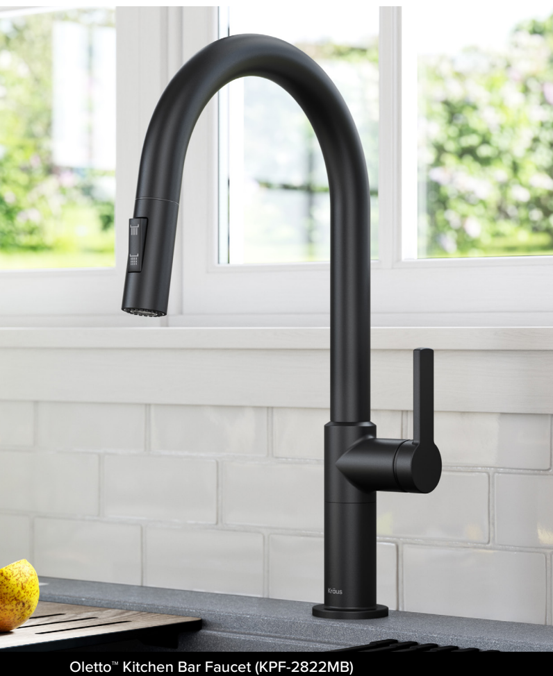
Oletto™ Kitchen Bar Faucet (KPF-2822MB)