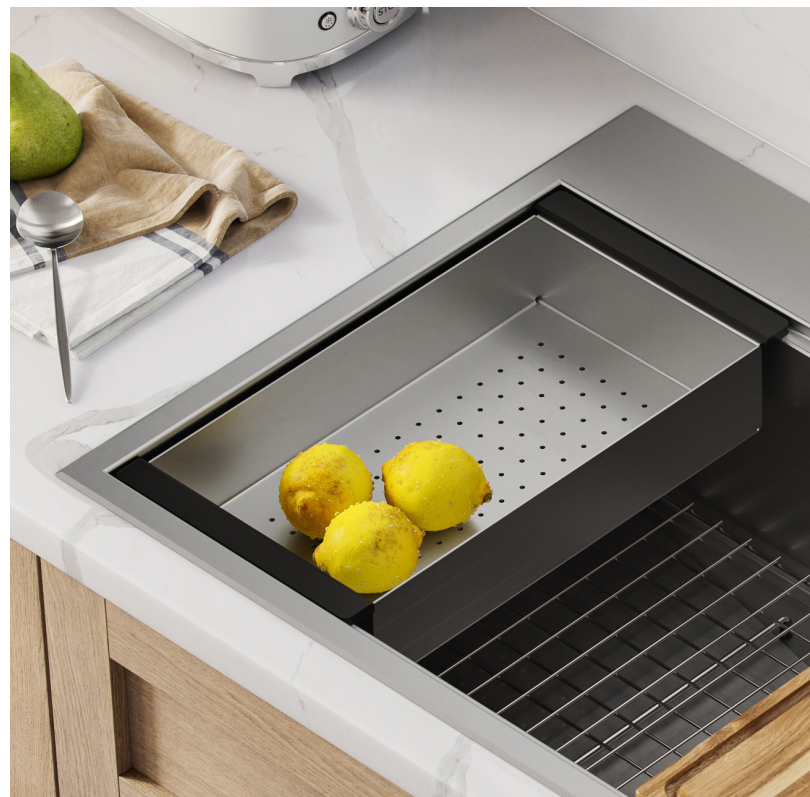
Stainless Steel Colander for Workstation Sink (CS-6)