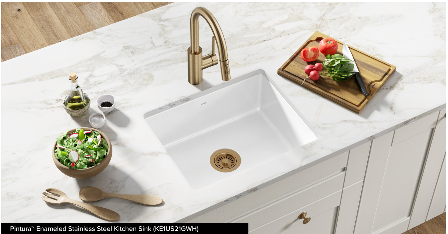
Pintura™ Enameled Stainless Steel Kitchen Sink (KE1US21GWH)