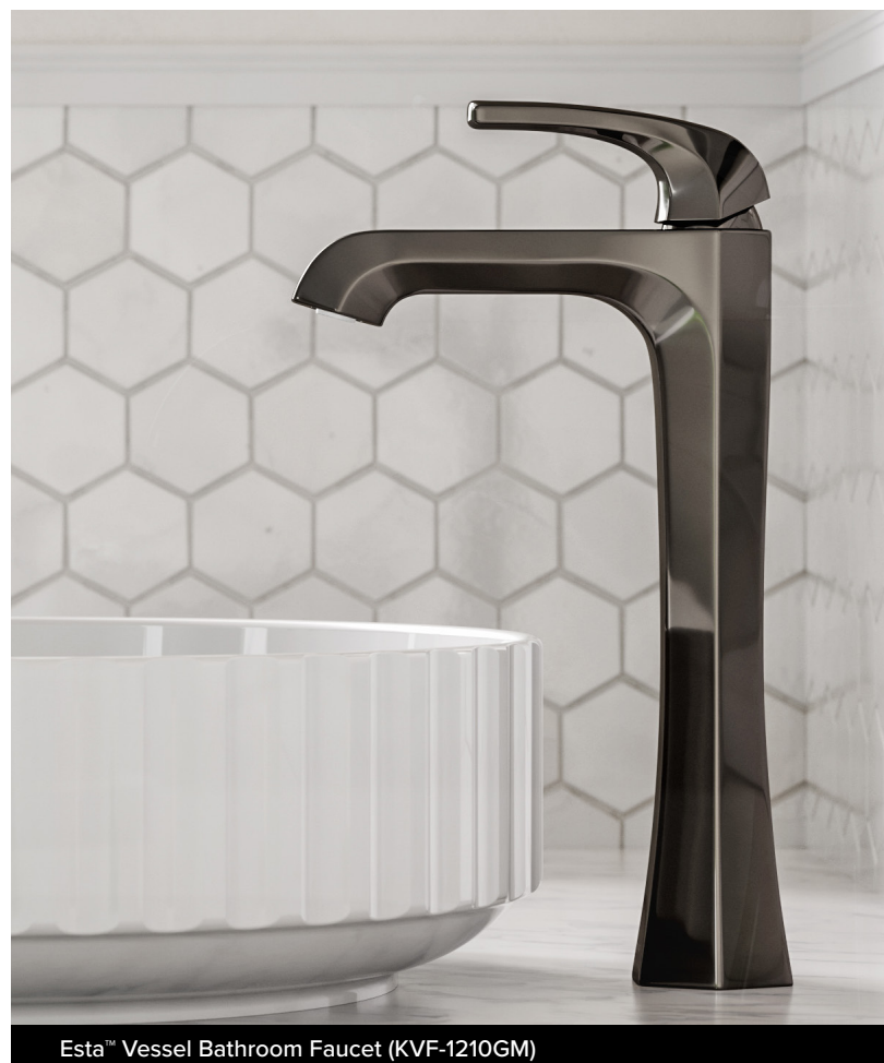
Esta™ Vessel Bathroom Faucet (KVF-1210GM)