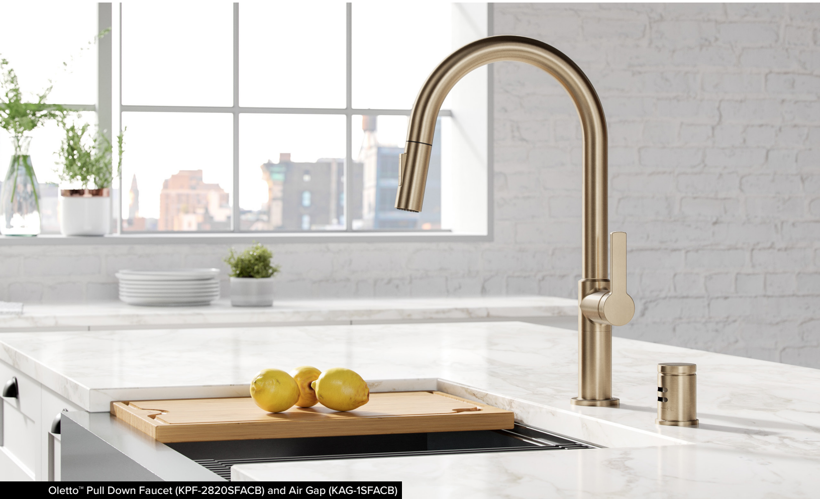
Oletto™ Pull Down Faucet (KPF-2820SFACB) and Air Gap (KAG-1SFACB)