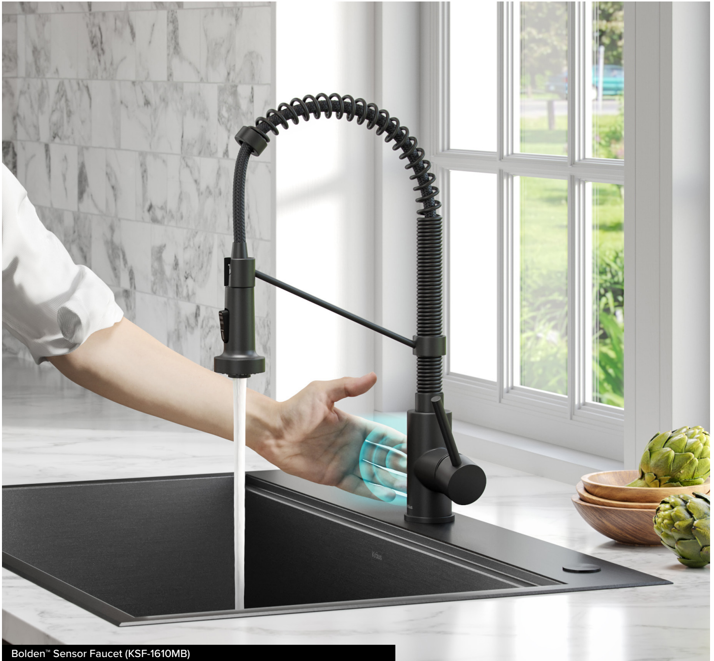
Bolden™ Sensor Faucet (KSF-1610MB)

Kraus Sensor Faucets are designed with hands-free capabilities, so they stay cleaner longer, with fewer spots and finger smudges over time. To clean and maintain your sensor faucet, simply follow the care instructions for Kraus Kitchen Faucets (Spot-Free Finishes or All Other Finishes), and enjoy the added benefit of ultra-clean hands-free functionality.