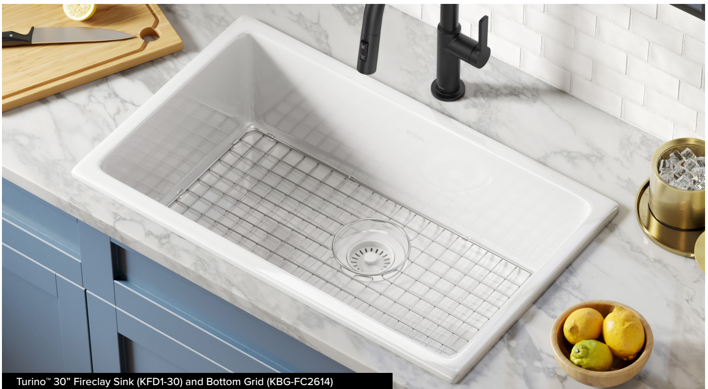
Turino™ 30" Fireclay Sink (KFD1-30) and Bottom Grid (KBG-FC2614)