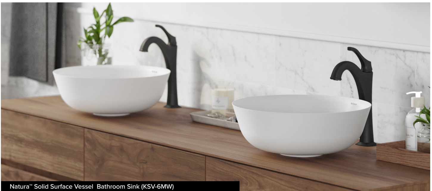
Natura™ Solid Surface Vessel Bathroom Sink (KSV-6MW)