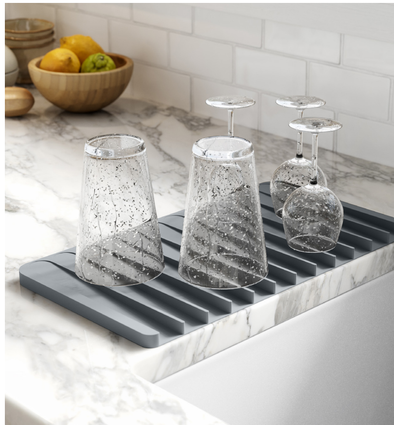
Self-Draining Silicone Dish Drying Mat (KDM-10)