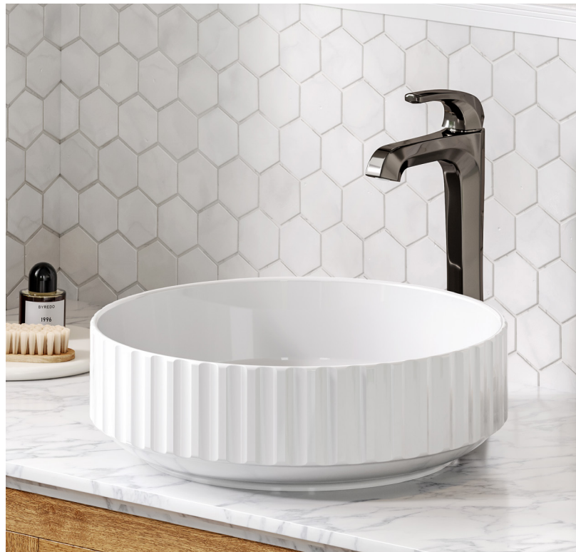
Viva™ Porcelain Ceramic Vessel Bathroom Sink (KCV-201GWH)