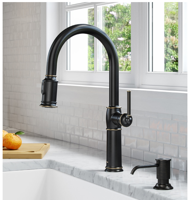
Kitchen Soap and Lotion Dispenser (KSD-80ORB)