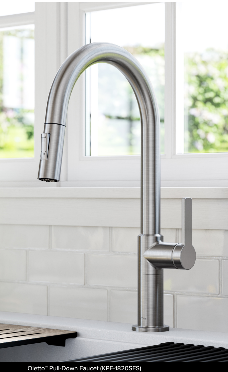
Oletto™ Pull-Down Faucet (KPF-1820SFS)

Keep your faucet looking newer longer with Spot-Free all-Brite™, a finish that requires less cleaning and shines longer by resisting water spots, fading, and fingerprints. For general maintenance of all-Brite™ faucets, we recommend cleaning your faucet with mild soap, rinsing thoroughly with warm water, and drying with a clean, soft cloth.