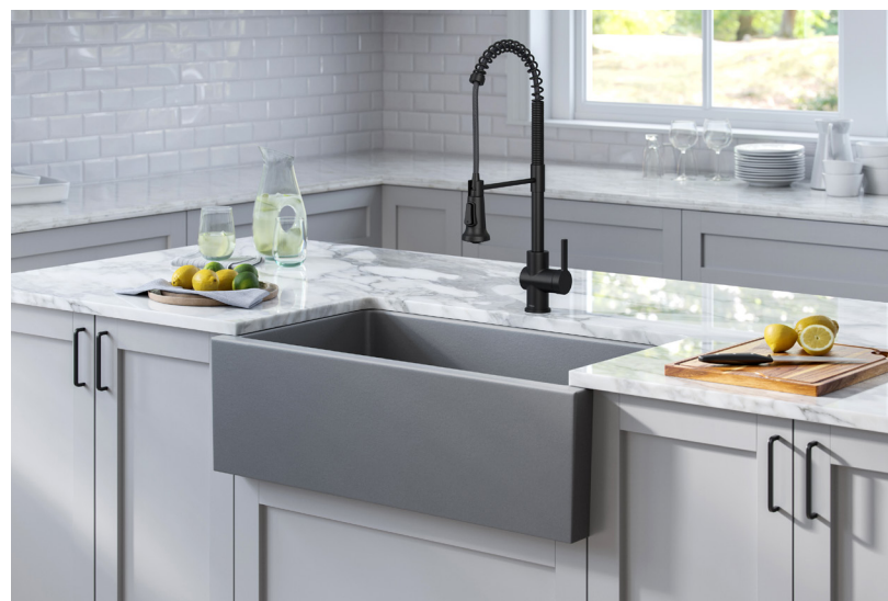
Turino™ 33" Fireclay Farmhouse Kitchen Sink (KFR1-33MGR)