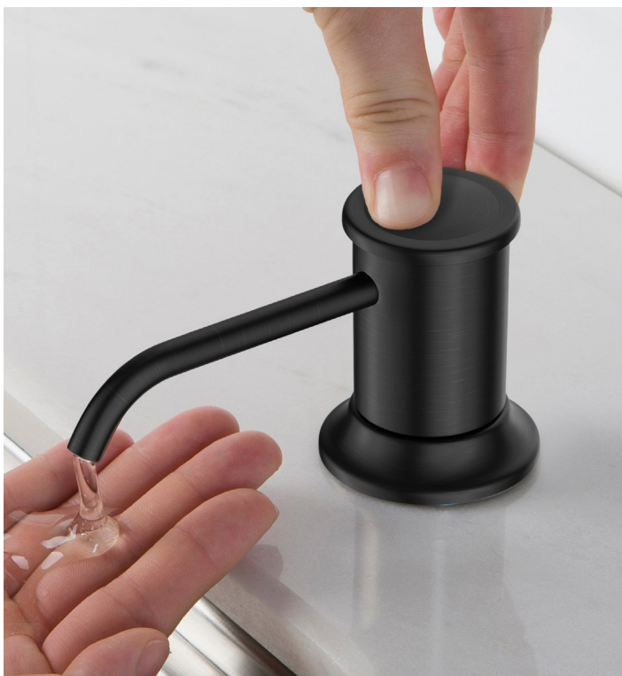
Kitchen Soap and Lotion Dispenser (KSD-80ORB)