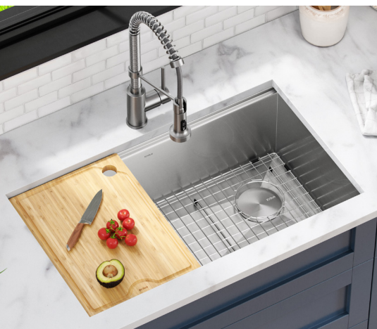
Kore™ Workstation Sink (KWU110-32)