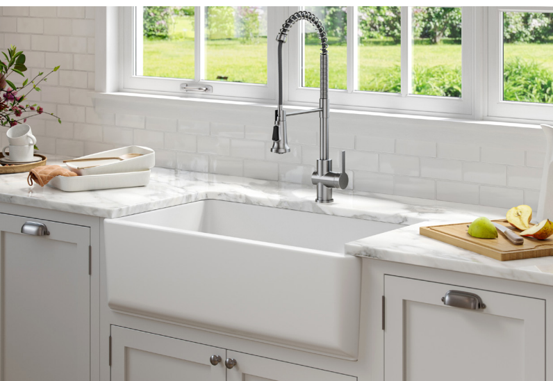
Turino™ 33" Fireclay Farmhouse Kitchen Sink (KFR1-33MWH)