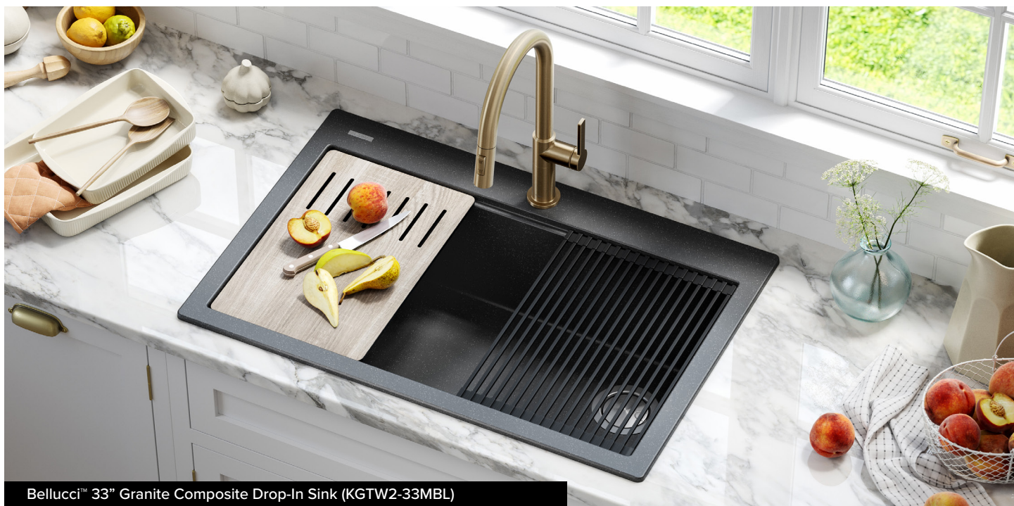
Bellucci™ 33" Granite Composite Drop-In Sink (KGTW2-33MBL)