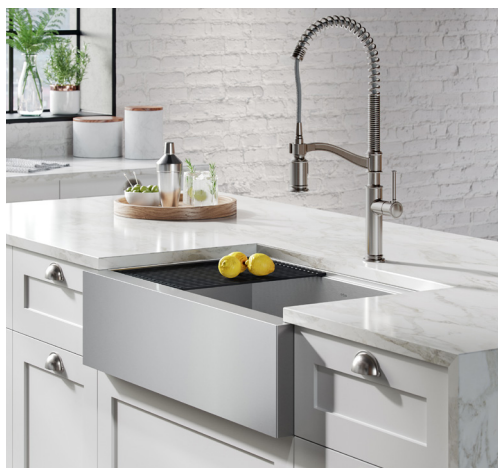
Kore™ Workstation Sink (KWF410-33)