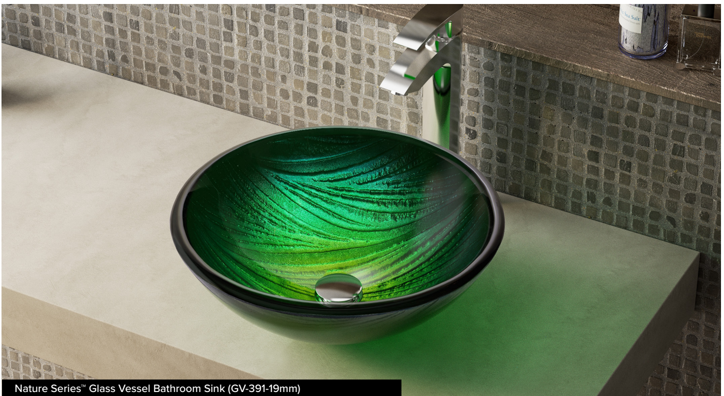
Nature Series™ Glass Vessel Bathroom Sink (GV-391-19mm)