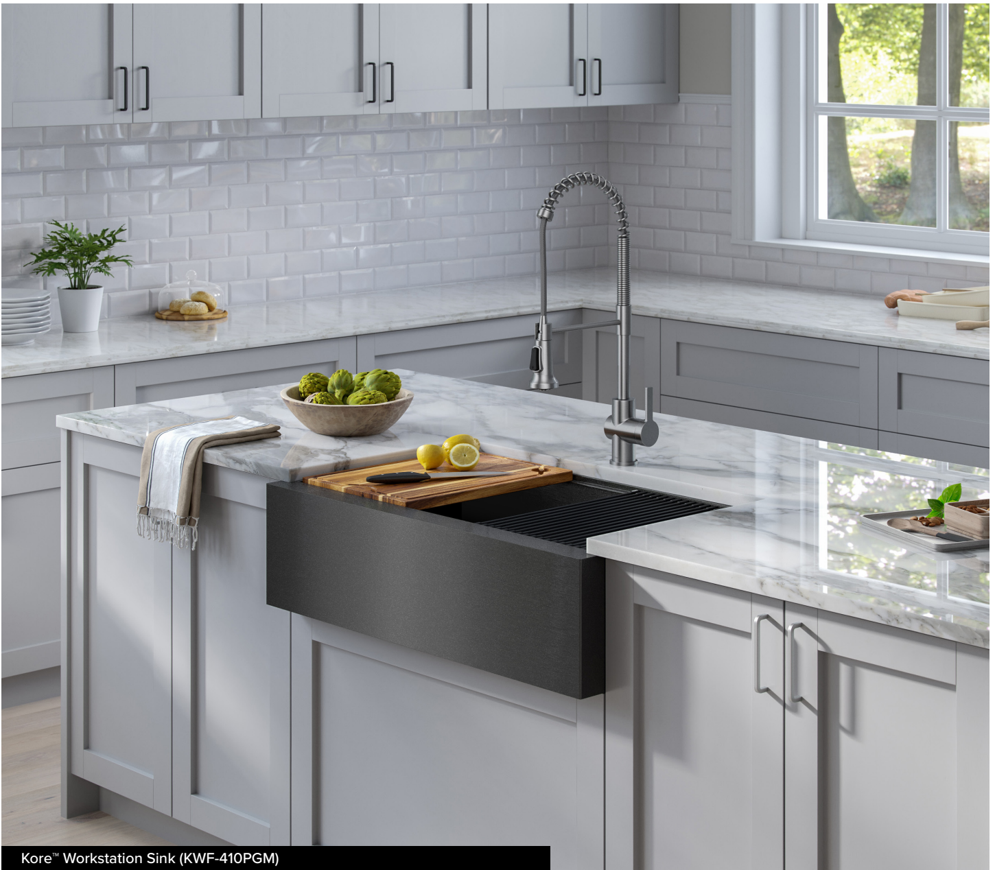
Kore™ Workstation Sink (KWF-410PGM)

Kraus PVD sinks are a showpiece in any kitchen, with a modern yet timeless appearance that is incredibly easy to maintain. Proprietary DuraShield™ finish application results in a color coating that bonds completely to the sink, resulting in unparalleled durability with superior resistance to abrasion, chips, and corrosion. The sandblasted matte texture resists water spots and fingerprints, so the sink stays cleaner longer. Maintenance is as simple as wiping down the sink surface with a microfiber cloth after use.