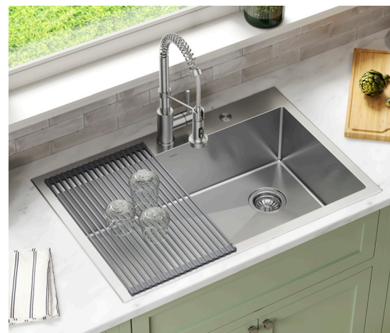
Loften™ Drop-In Sink (KHT410-33)