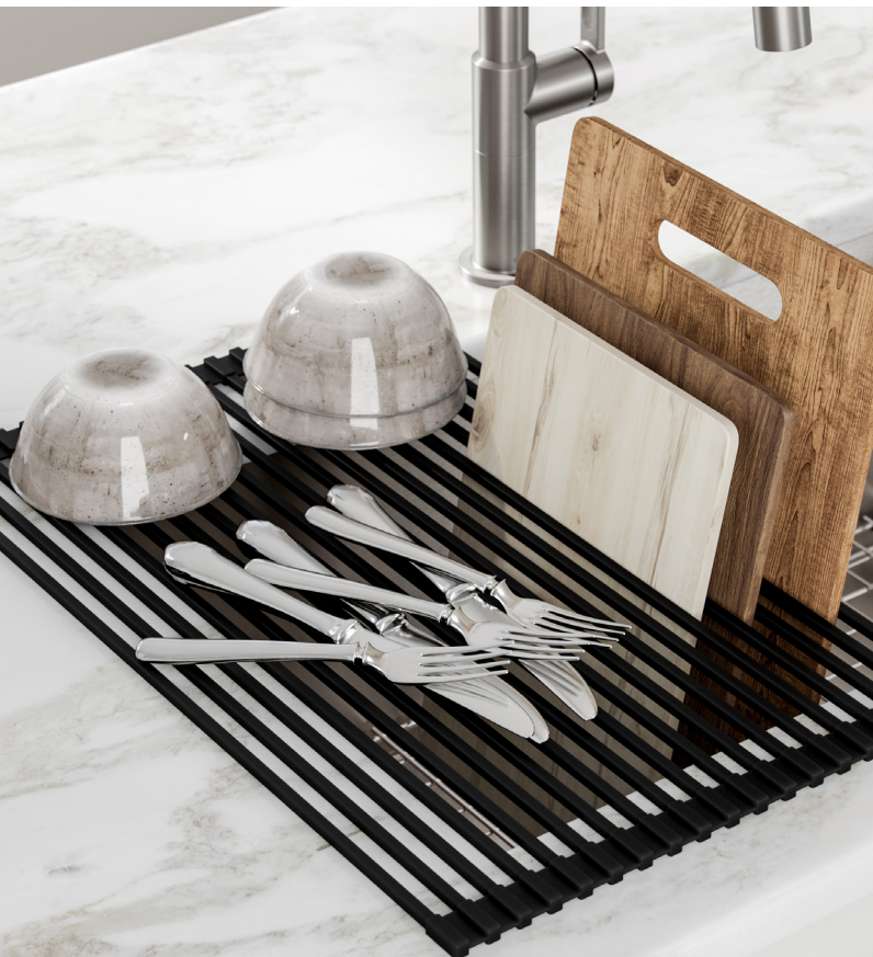
Multipurpose Over-Sink Roll-Up Dish Drying Rack (KRM-10)