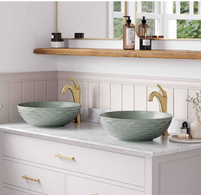
Viva™ Porcelain Ceramic Vessel Bathroom Sink (KCV-200GGR)