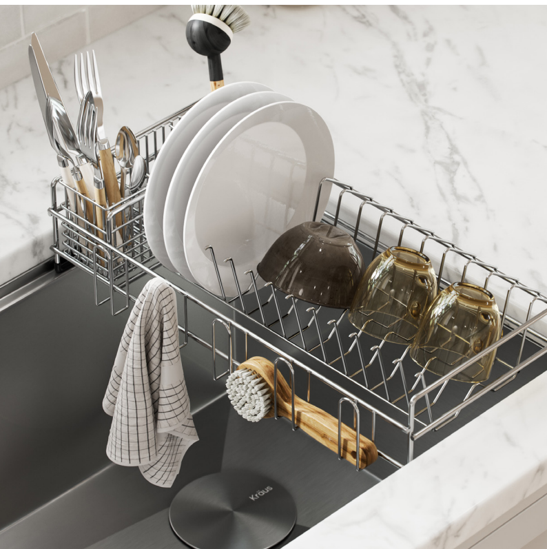
Workstation Sink Dish Drying Rack (KDR-3)