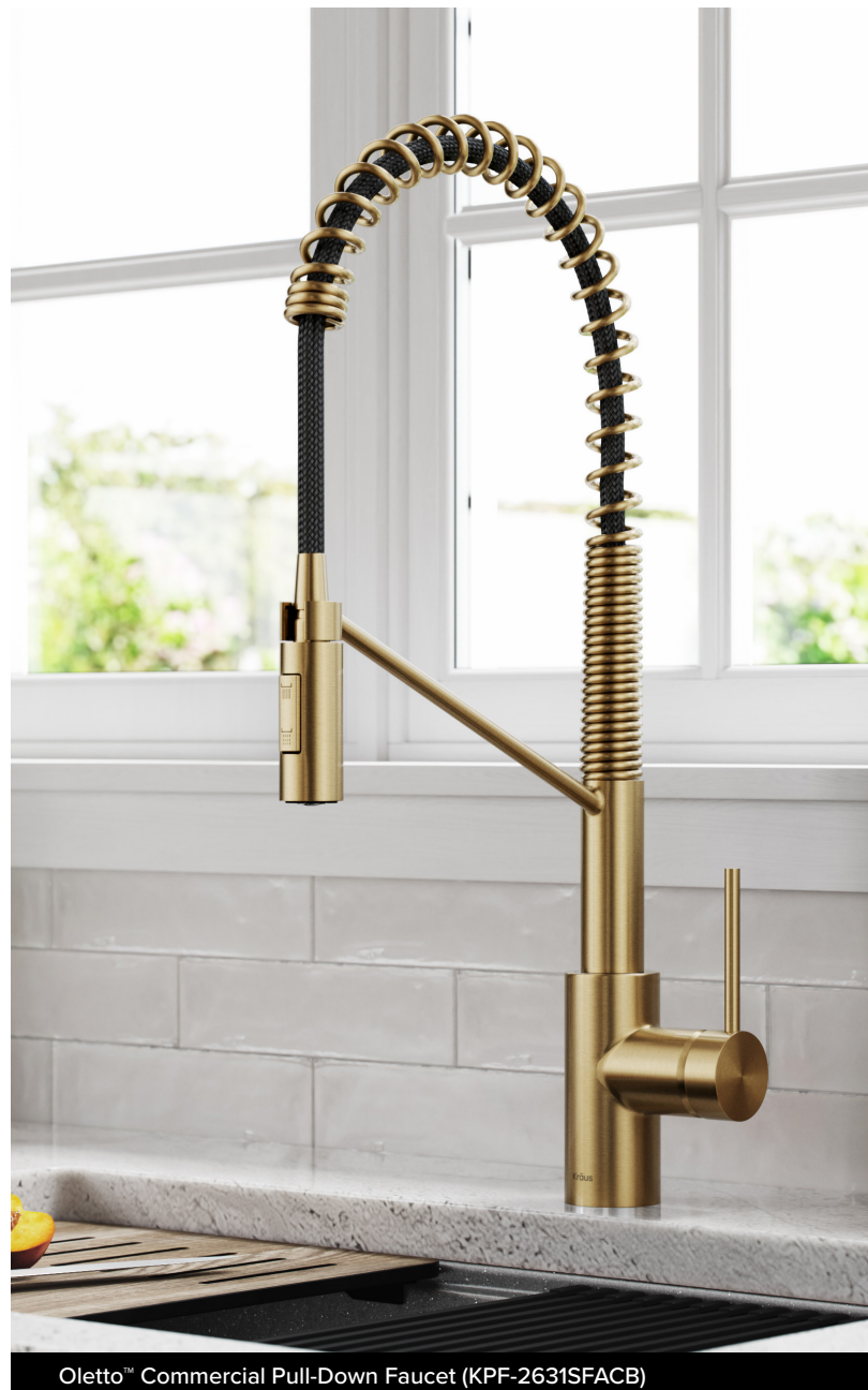
Oletto™ Commercial Pull-Down Faucet (KPF-2631SFACB)