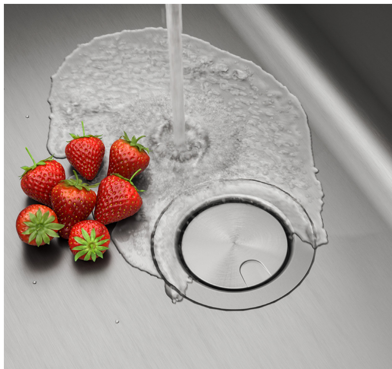
Stainless Steel Drain Assembly with Strainer (ST-4)