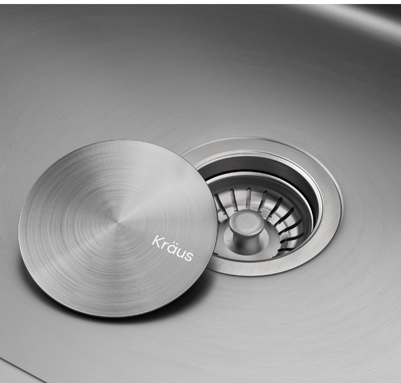
CapPro™ Removable Decorative Drain Cover (STC-2)