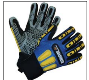
Model WGCoolRIGG Dryrigger CoolRigger with breathable back fabric to allow airflow in hot conditions