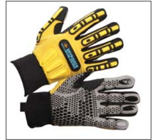
Model WGWIRIGG Dryrigger Sub-Zero insulated with 100 grams Thinsulate™ for use in cold temperatures