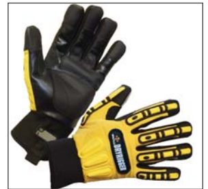
Model WGRIGGSF Dryrigger Silicone-Free with reinforced polyurethane palm and materials without traces of silicone