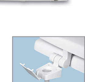
NON-CORROSIVE BOLTS AND WING NUTS