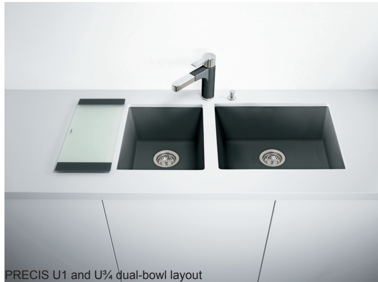
PRECIS U1 and U¼ dual-bowl layout

Made of ultra durable granite composite material, BLANCO SILGRANIT® combines 80% natural granite, with high-quality acrylic for unmatched strength and durability.