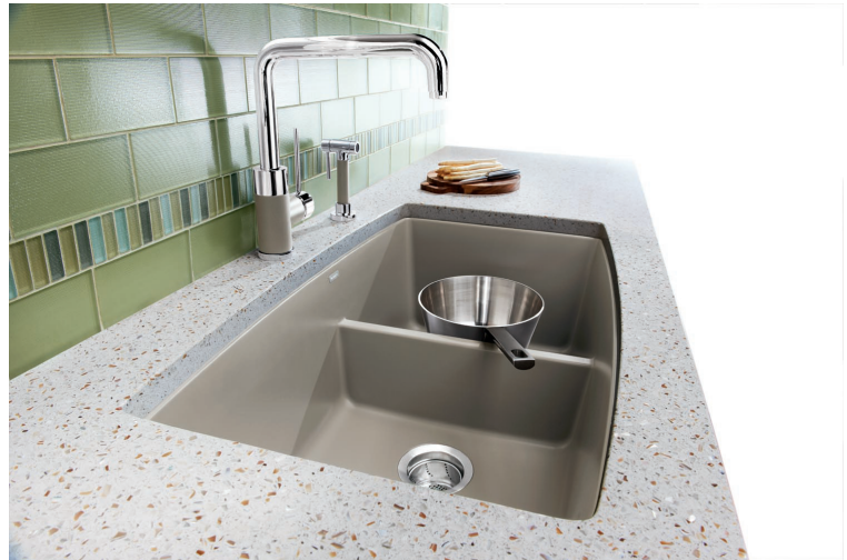
401188 (faucet not available in Canada)

Made of ultra durable granite composite material, BLANCO SILGRANIT® combines 80% natural granite, with high-quality acrylic for unmatched strength and durability. The Performa U1 3/4 is an elegant undermount kitchen sink that features a low divide between sink bowls and comes in four natural stone colours.