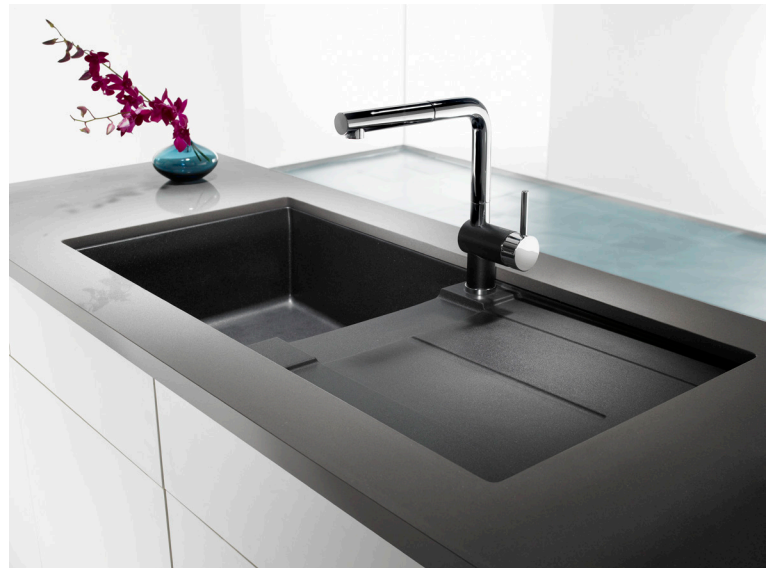
Model 401045 shown with BLANCO POSH Chrome/Anthracite faucet

Made of ultra durable granite composite material, BLANCO SILGRANIT® combines 80% natural granite, with high-quality acrylic for unmatched strength and durability. The centre-positioned drain hole allows the sink to be installed with the drainboard on either side.