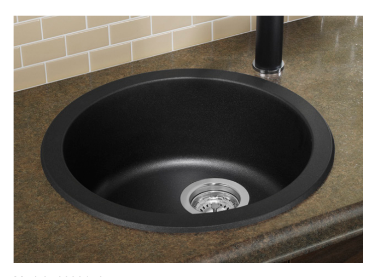
Model 400801 shown