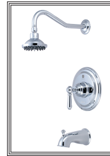
#4AM100T SHOWN * ADA