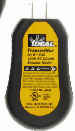
Live Circuit Indication