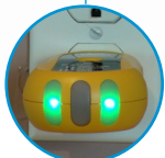
Polarity & Live Circuit Indication