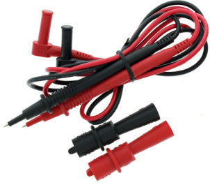
TL-757 Test Leads