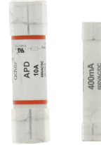
F-337P 10A (600V) & 400mA (600V) Fuses for 61-337