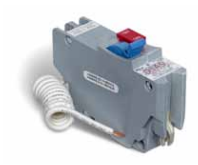
NA One Pole GFI Breaker 2 Spaces Required