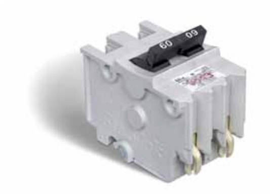
Stab-lok Two Pole (NA) Breaker 4 Spaces Required