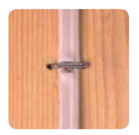
Punctured Cable by Nail or Staple