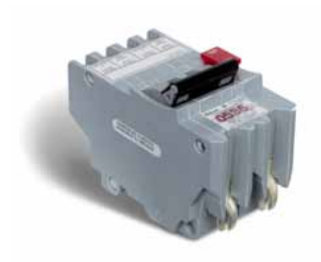
NA Two Pole GFI Breaker 4 Spaces Required