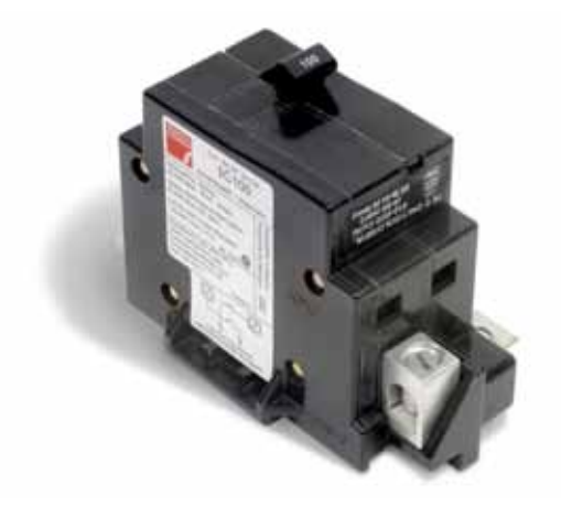
100A Main Breaker