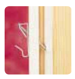
Nails or screws carelessly driven into walls