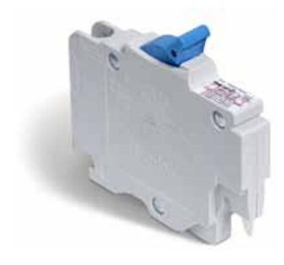
Stab-lok One Pole Breaker 1 Space Required

NC015CP/NC0215CP - Black/Blue NC020CP/NC0220CP - Red NC030CP/NC0230CP - Green NC040CP/NC0240CP - Grey Greater than 50A breakers - Black