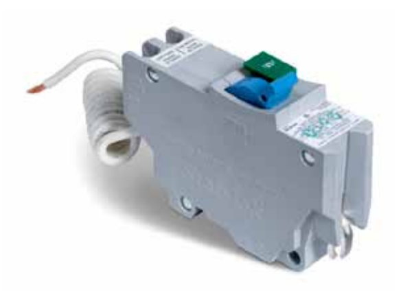
15 A Arc Fault Breaker 2 Spaces Required