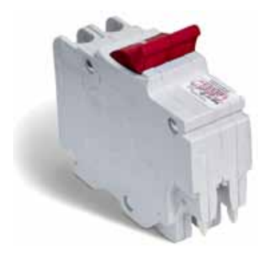
Stab-lok Two Pole Breaker 2 Spaces Required