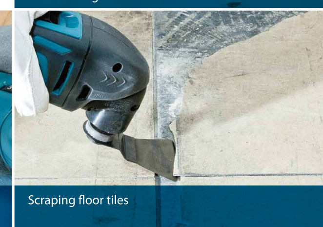
Scraping floor tiles