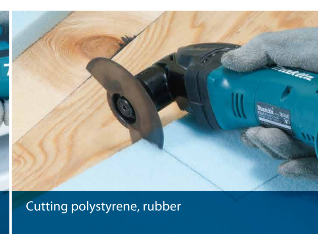
Cutting polystyrene, rubber