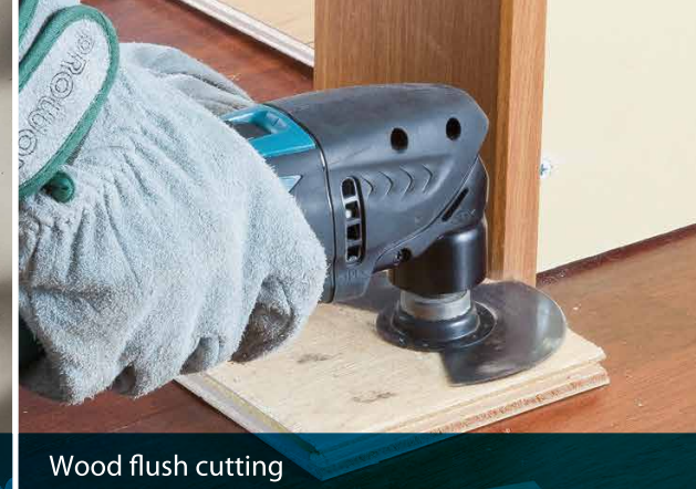
Wood flush cutting