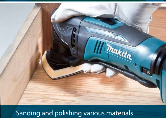
Sanding and polishing various materials