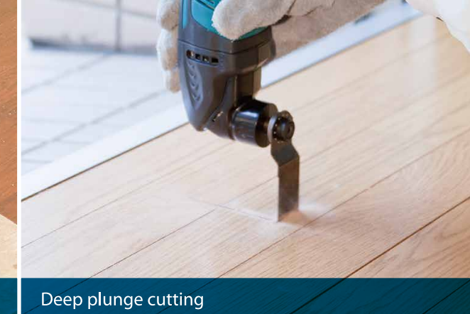
Deep plunge cutting