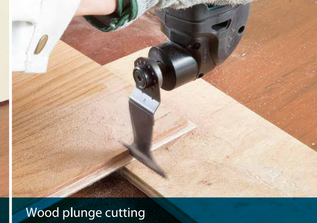
Wood plunge cutting