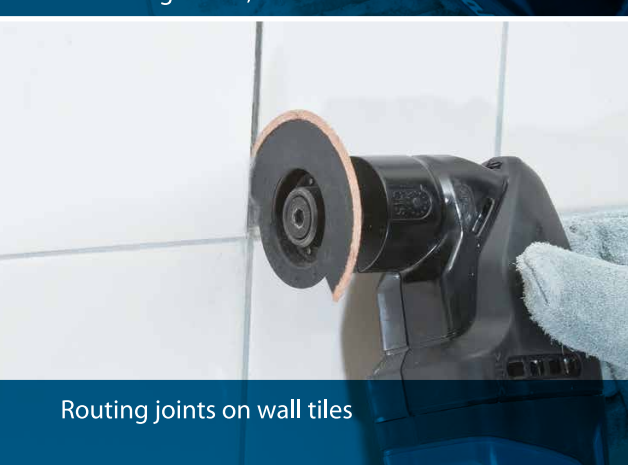
Routing joints on wall tiles