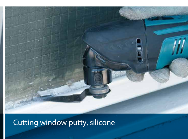
Cutting window putty, silicone