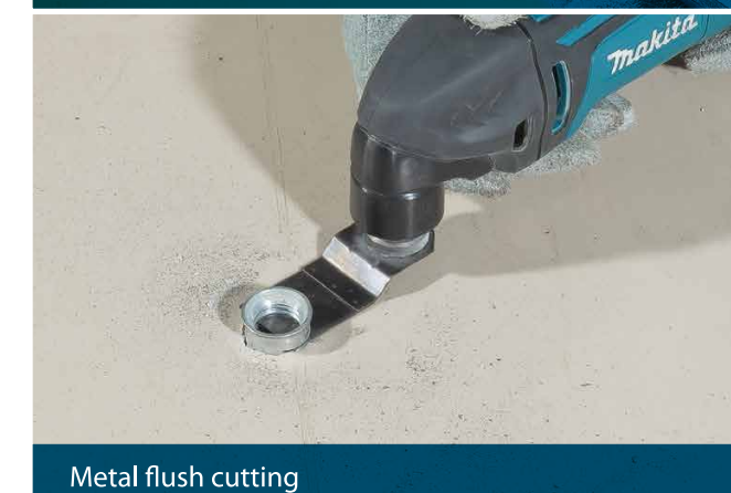
Metal flush cutting