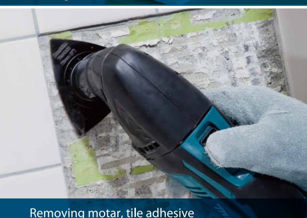
Removing mortar, tile adhesive