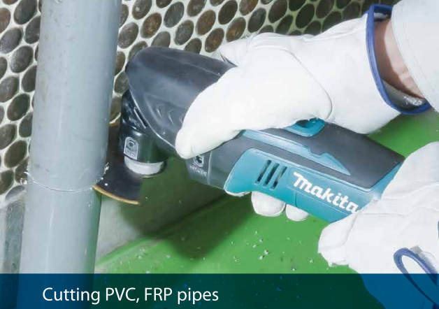
Cutting PVC, FRP pipes