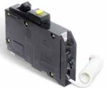
QO One Pole GFI Breaker 1 Space Required