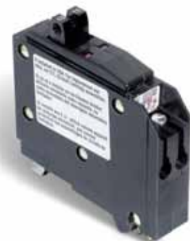
QO Tandem Breaker 1 Space Required

Tandem (Space Save) circuit breakers are ideal for adding additional circuits to an existing panel with limited space.