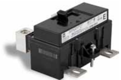
QO 200A Bolt On Main Breaker (QOM2 Frame Size)