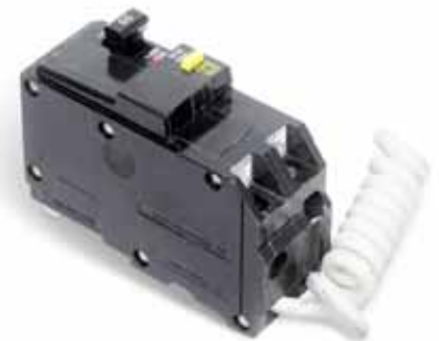
QO Two Pole GFI Breaker 2 Spaces Required