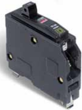
QO One Pole Breaker 1 Space Required