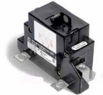
QO 100A Bolt On Main Breaker (QOM1 Frame Size)

Main Breakers include factory installed handle padlock attachment (padlock QOM main circuit breaker in the ‘off’ position).