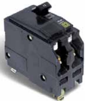
QO Two Pole Breaker 2 Spaces Required

High magnetic breakers are recommended for applications where high initial inrush current may occur.