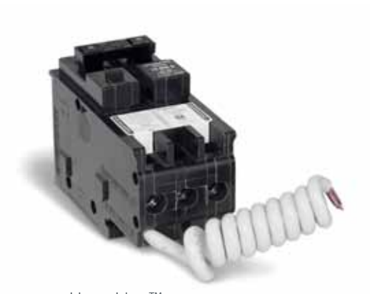
HomeLine™ Two Pole EPD Breaker 2 Spaces Required