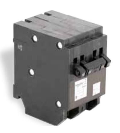
HomeLine™ Quad Breaker 2 Spaces Required