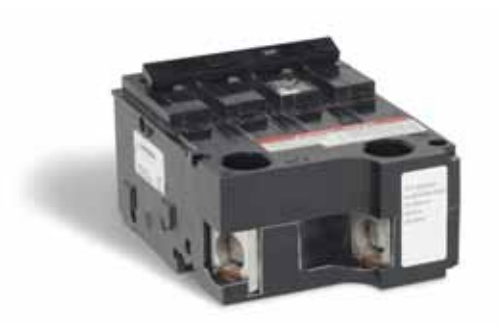
HomeLine^{\mathsf{TM}} Two Pole Breaker 200A 4 Spaces Required

What is Power? Power is the rate of doing work measured 1 HP = 746 Watts