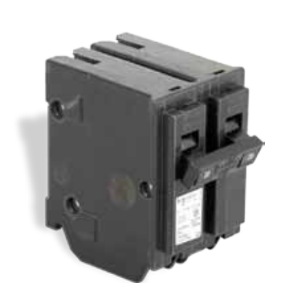
HomeLine™ Two Pole Breaker 2 Spaces Required