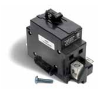
QOM1 Frame Size Main Breaker

Main Breakers include factory installed handle padlock attachment (padlock QOM main circuit breaker in the 'off' position).