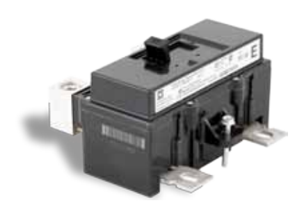
QOM2 Frame Size Main Breaker