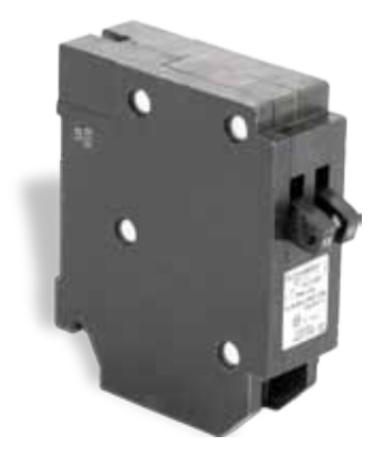
HomeLine™ Tandem Breaker 1 Space Required