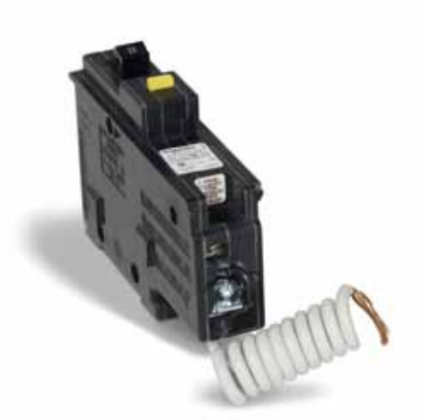
HomeLine™ One Pole GFI Breaker 1 Space Required

The CEC allows the use of an EPD for heat trace, to prevent freezing of pipes, rain gutters, etc. Other applications include protection of equipment such as well pumps and other electrical equipment in the home or garage.