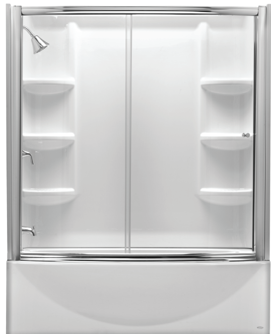
Saver tub with Saver wall set and Saver curved shower door shown.

For color/finish availability and other faucet choices, please see the Product Selector and Pricing Guide.